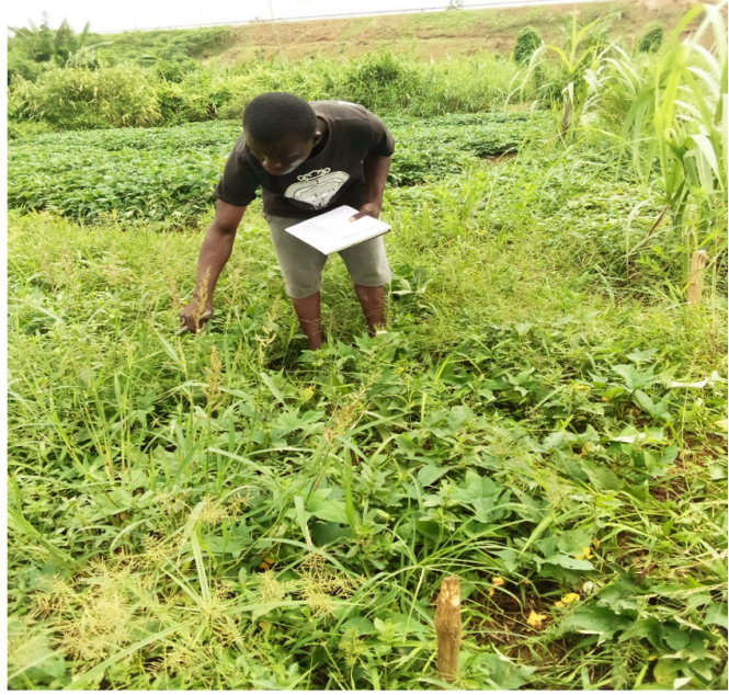
Figure 1: Inventory of weeds in a sweet potato plot

1993). It thus makes it possible to identify species that may have been missed during the surveys in the delimited areas. Each of the four locations was surveyed 30 times, resulting in a total of 120 surveys.