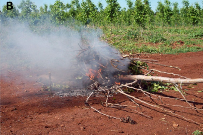
Figure 3: Complete eradication of commercial orchards (A) and individual trees (B)